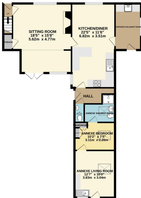
GROUND FLOOR 950 sq.ft. (88.2 sq.m.) approx.